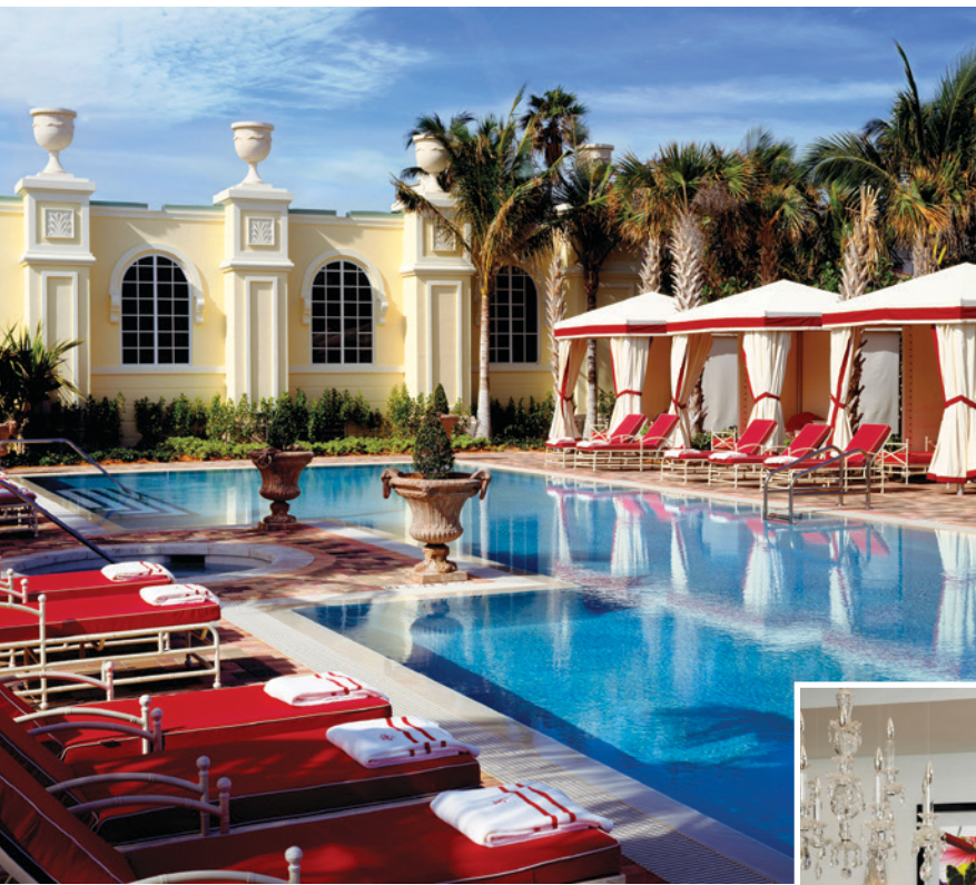
IN ADDITION TO ITS ACQUA EXPERIENCES, ACQUALINA RECENTLY UNVEILED A NEW PENTHOUSE SUITE THAT INCLUDES A DINING ROOM AND A LARGE TERRACE WITH A PRIVATE SALTWATER SWIMMING POOL.