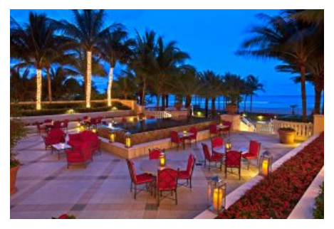
Views of the outdoor terrace at Acqualina.

Travel agents can let their clients know they can work with the resort to set up special wine tastings with the Antinori wine representative to pair with menus for weddings and other family or friend group events.