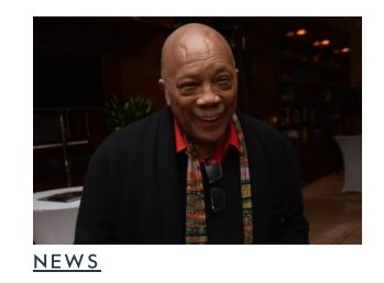
Haute Living & Rolls-Royce Motor Cars Celebrate Quincy Jones'...